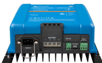
Phoenix Smart 12/50(3)