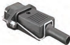
Retainer clip (included)