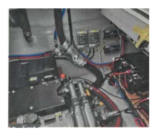
Practical: The compartments beneath cockpit sole, aft, house the engines, batteries and autopilot ram.