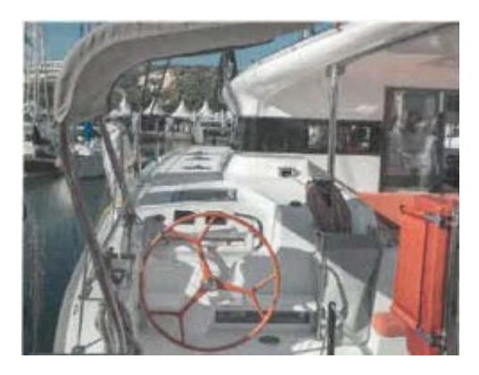
Practical: At the port helm station, a halyard bag holds the long code 0 and spinnaker halyards.