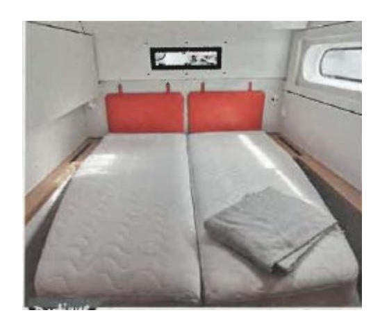
Practical: All double bunks are 2 x 1.60m (6'7" x 5'3"), with side access. Great comfort!