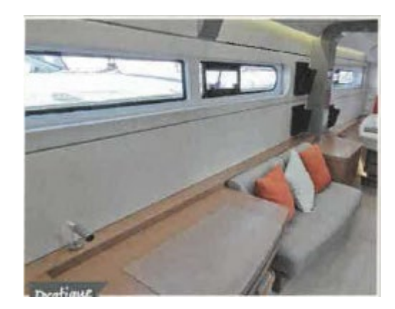
Practical: The very long portlights are both aesthetic and sufficient to provide light and a view of the sea.