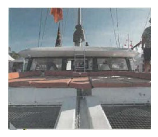
Not practical: The fixed ladder for accessing the coachroof leads to a large curved space with no handrails