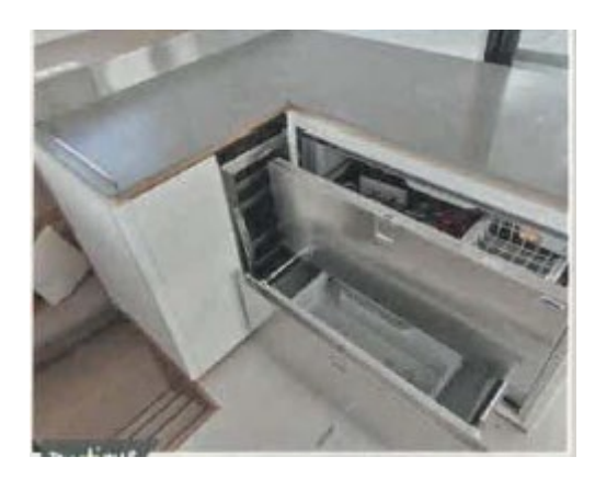
Practical: In the galley, to port, there is a second fridge-freezer (optional) and even a wine cellar.