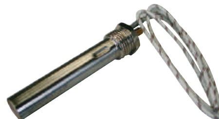
Preset at 141 °C - code P504.RV.038.00 Preset at 68 °C - code P504.RV.019.00

The temperature at which the sheath is taken. Any change in temperature dilates the sheath, which thus increases the tension that it exerts on the plate, switching the contact, as appropriate