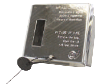
Control box - code 23022

Alarm audible buzzer included in the units will sound when system has been activated. Remove safety pin lift, open door, press red button inside to activate discharge