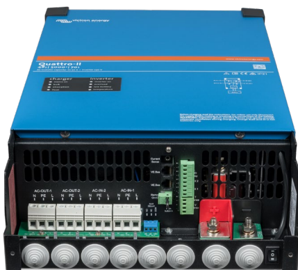
Connection Area Quattro-II 48/5k

Measures battery voltage and temperature and allows monitoring and control with a smart phone or other Bluetooth enabled device.