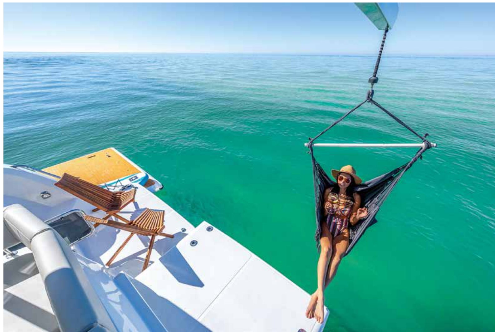
The crane system for the tender either works by hand or operates electrically and can hold up a hammock when the tender is out