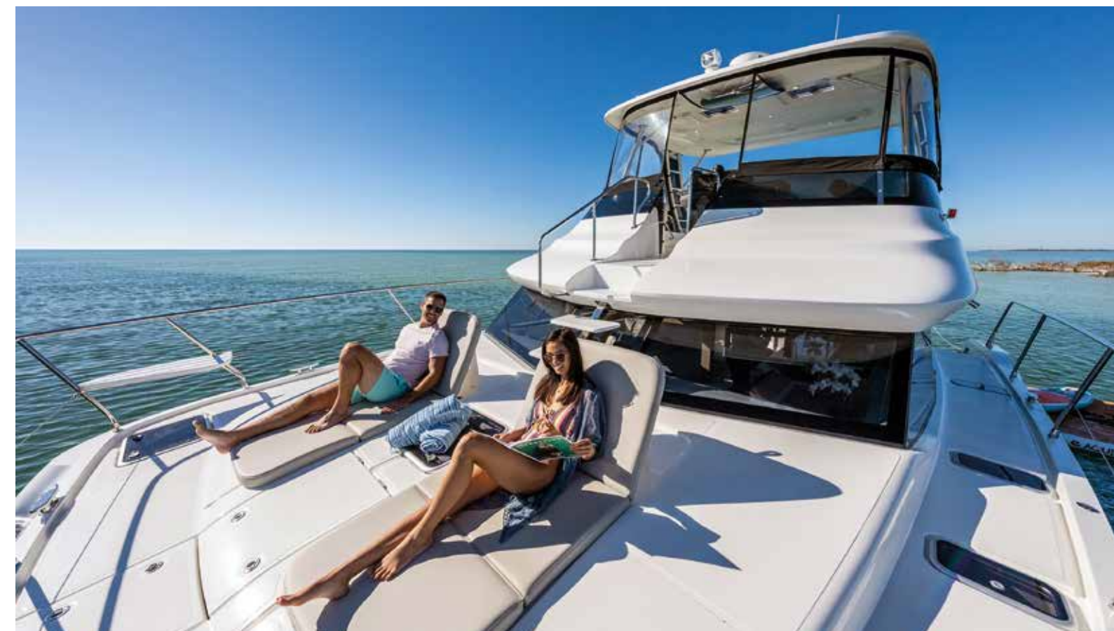
The 42 Yacht features Aquila's iconic forward flybridge steps, while the foredeck has two flexible sunpads, each able to host a couple

As per the 44 Yacht, the cockpit connects to the galley via an