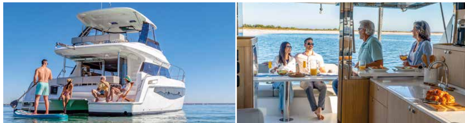
The 42 Yacht retains Aquila signatures including large aft platforms (left) and cockpit bar stools by the galley countertop (right)

As we piloted from the flybridge, the boat came on plane in eight seconds. At 1,500 rpm, speed was 9.3 knots; at 2,500, 12.4 knots; at 3,000, 18.1 knots. Ultimately, the 300hp Volvo Penta D4s were able to push our boat to a top end of over 21 knots at 3,450rpm.