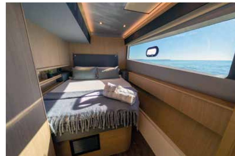
The starboard cabin features an aft-facing bed and en-suite bathroom

Fit and finish was exceptional across both interior and exterior, from the glass work to the double-stitching in the exterior seating to the big beefy stainless cleats that have become an Aquila signature.