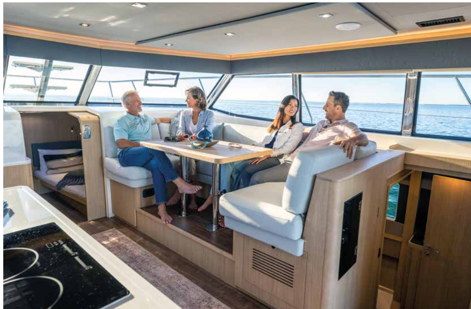
The raised saloon enjoys plenty of natural light from wraparound windows; the unit pictured features the forward utility cabin, pictured on left

opening window and counter, with two bar-style seats. That kind of arrangement connects inside and out on fair-weather days, while when it's raining, everything buttons down nicely.