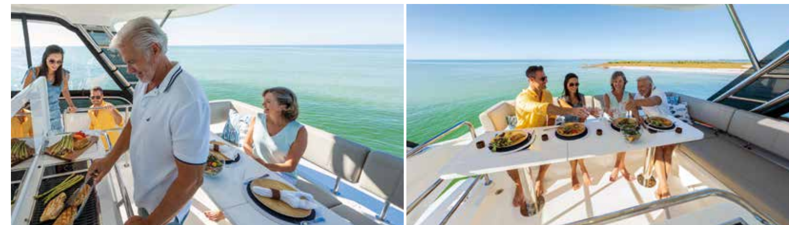
Accessible from both the cockpit and foredeck, the flybridge has a central wet bar (left) and L-shaped seating (right) aft and along the port side