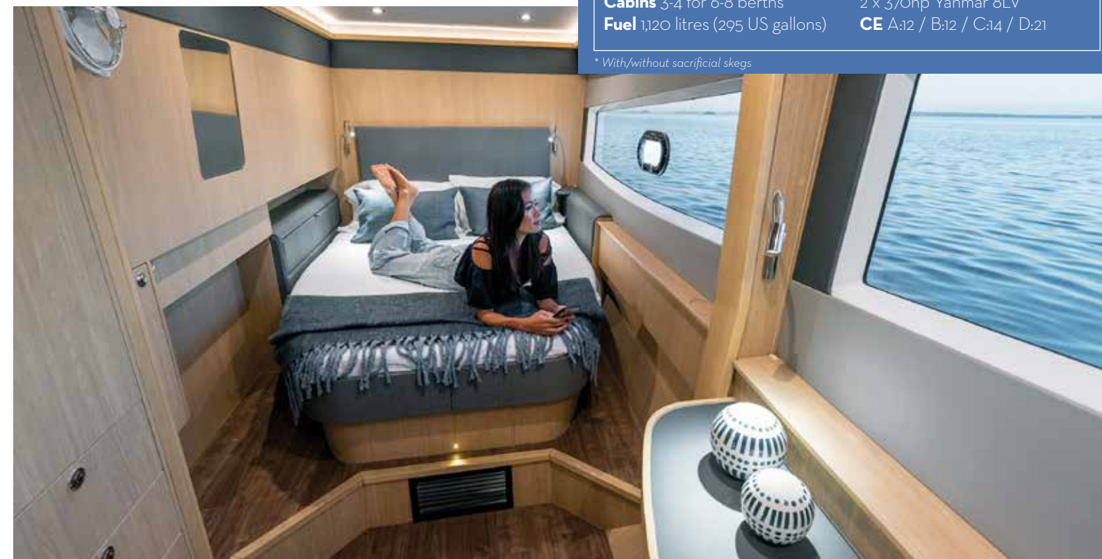
The master suite in the port hull has a desk by the window and conceals a fold-down vanity counter below the bulkhead mirror