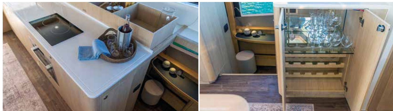
The galley (left) features plenty of storage while forward of the port stairs is a cabinet (right) and console in an area that can feature a lower helm station

In the three-cabin option, the forward utility cabin becomes a larger third stateroom by having a double berth athwartships, cutting out the starboard bulkhead and using the space for the large storage box forward in the starboard hull as an en-suite, accessed by steps. In the four-cabin layout, the starboard cabin becomes the master and the port hull features two cabins, fore and aft of a shared bathroom.