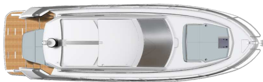
Top view with hard-top closed