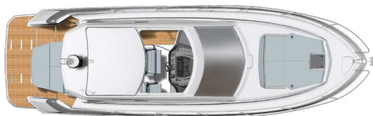
Top view with hard-top open