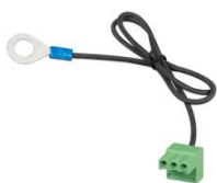
Connector with preassembled DC minus cable (included)